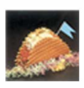
Get a Bigger scoop of Ice-cream business